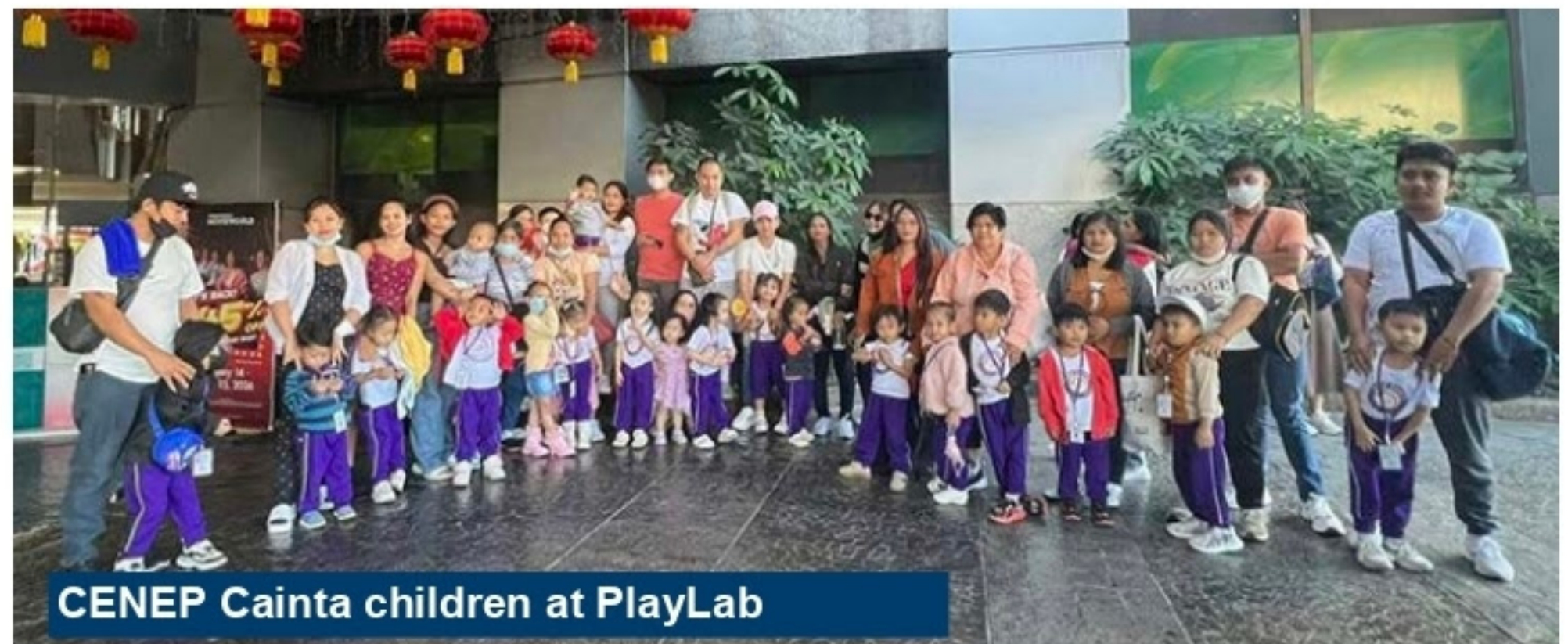
CENEP Cainta children at PlayLab

The tour started at PlayLab in Robinson's Galleria, the first digital playground in the country. Equipped with state-of-the-art digital tools, the facility offers a space for children to brainstorm, socialize, experience hands-on learning, and play. PlayLab was designed to provide children, and even adults, an inspiring atmosphere where ideas can grow into tangible experiences.