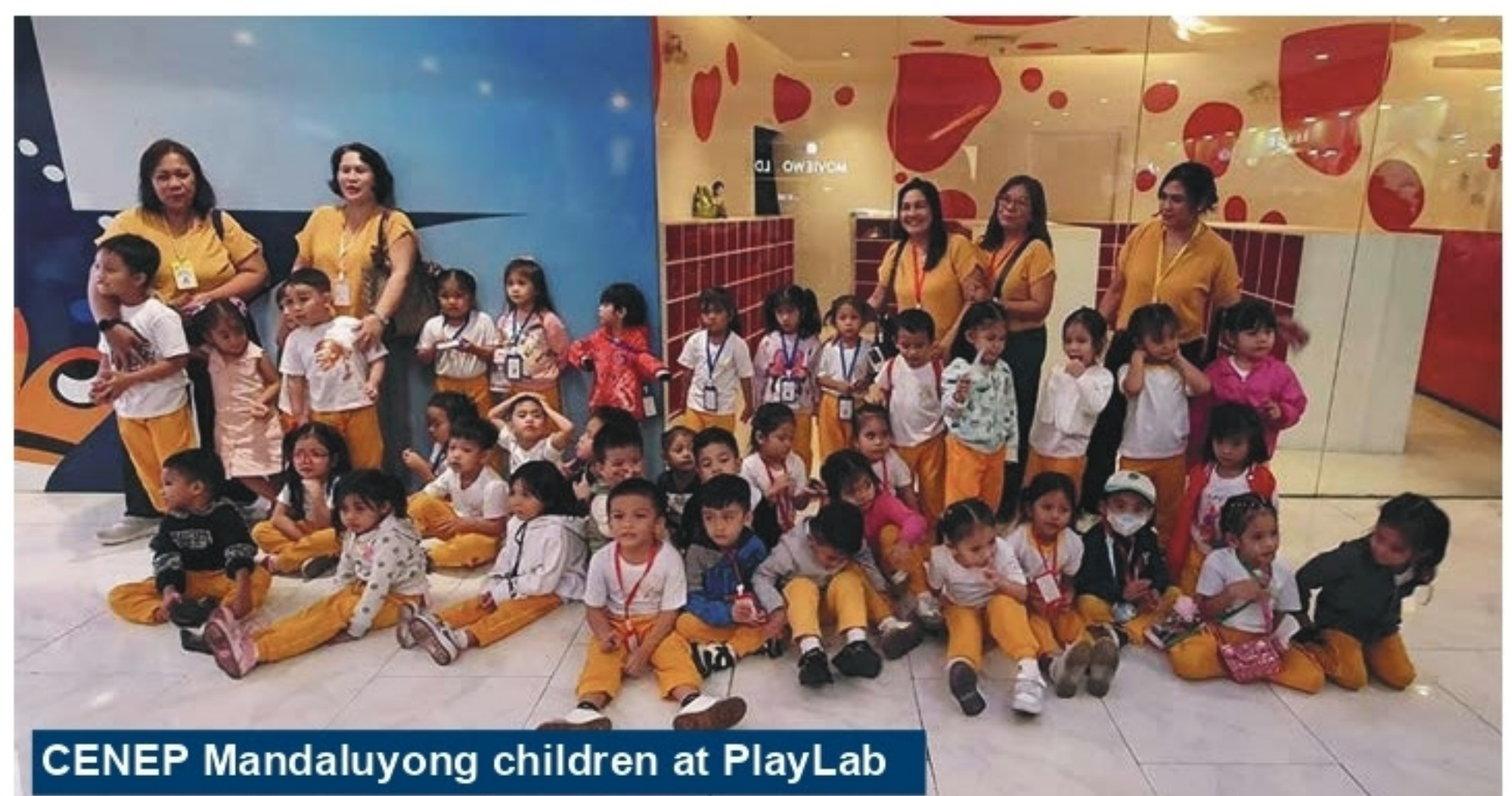
CENEP Mandaluyong children at PlayLab

On January 23, 2026, a total of 124 children from CENEP Mandaluyong, Marikina, and Cainta, most of whom were accompanied by their parents, went on a day-long field trip to two facilities catering to children in Pasig City. All the CENEP teachers were on hand to look after the children from their respective sites.