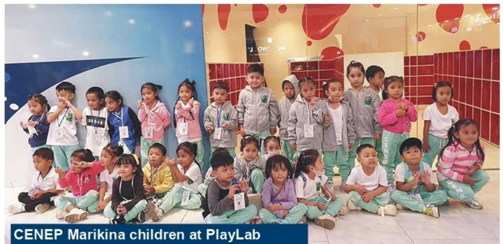
CENEP Marikina children at PlayLab