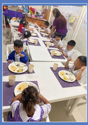
Cainta meal time