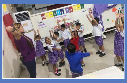
Cainta exercise time