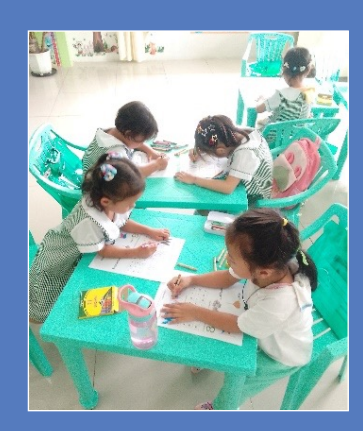
Marikina writing time